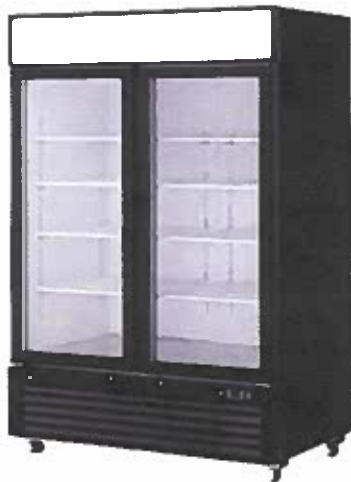
EFI Sales - 54" Double Glass Door Refrigerated Merchandiser - C2-54GDVC