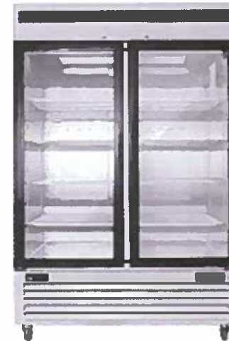
EFI Sales - 39.5" Double Glass Door Refrigerated Merchandiser - C2-39GDSVC