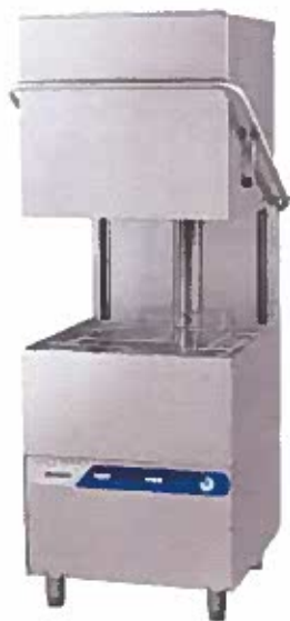
Omcan - 26" Upright High Temperature Dishwasher 10.5 kW - 46797