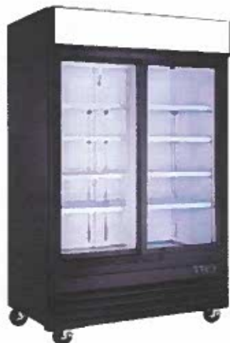
EFI Sales - 54" Double Glass Door Refrigerated Merchandiser - C2S-54GDVC