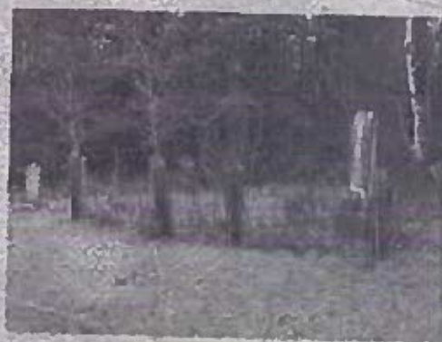
A typical country church

A Magnetawan Community Development Project