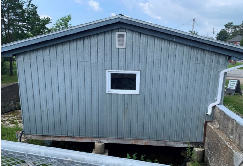
Wall #4 Potential Mural