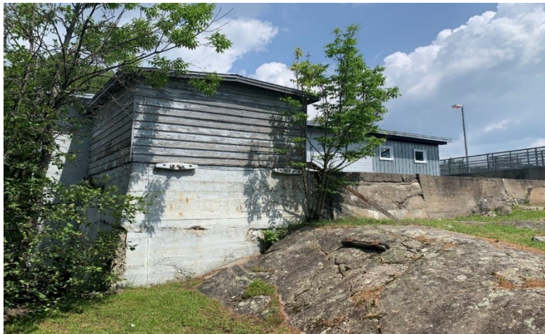
Wall #5 Potential Mural